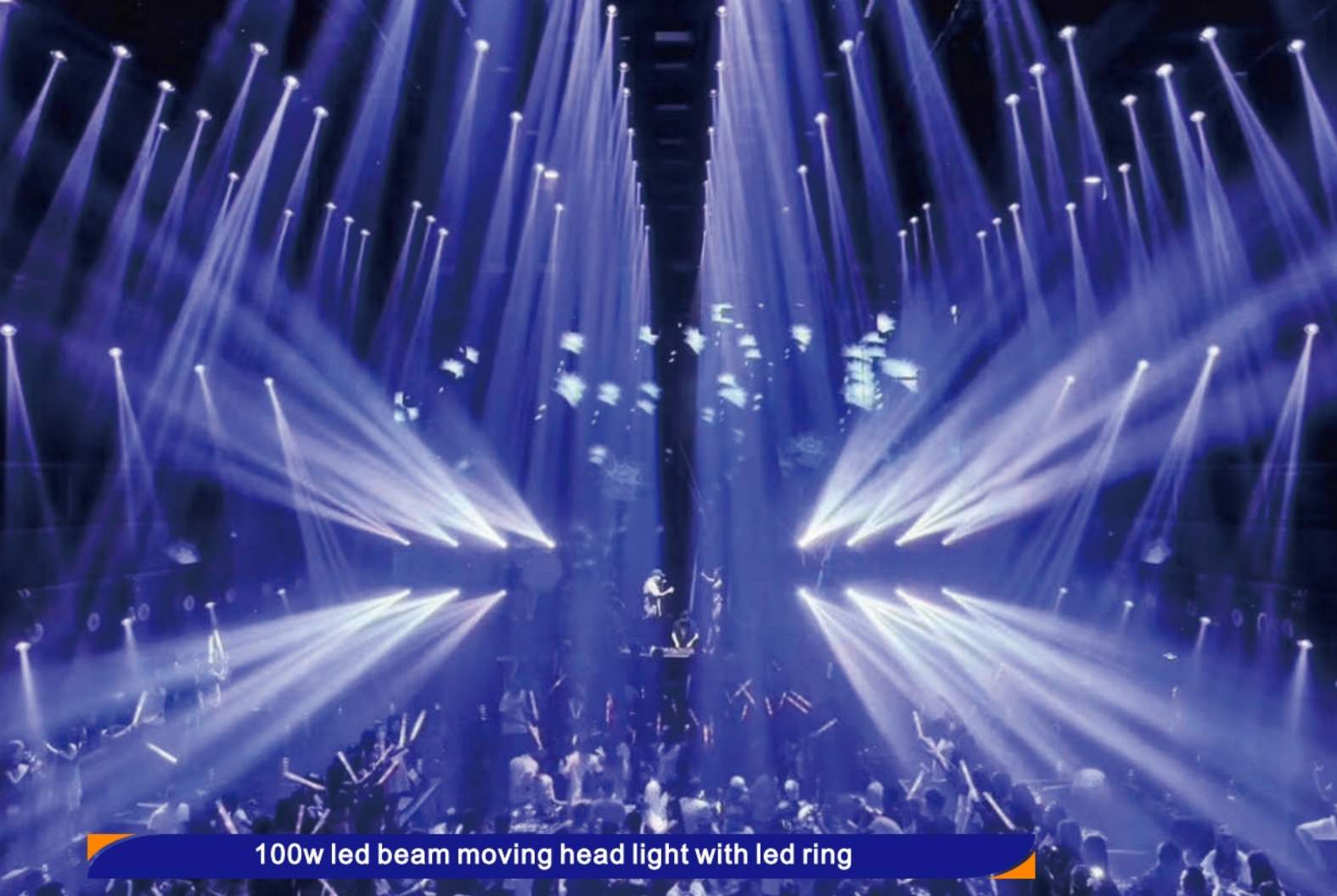
100w led beam moving head light with led ring