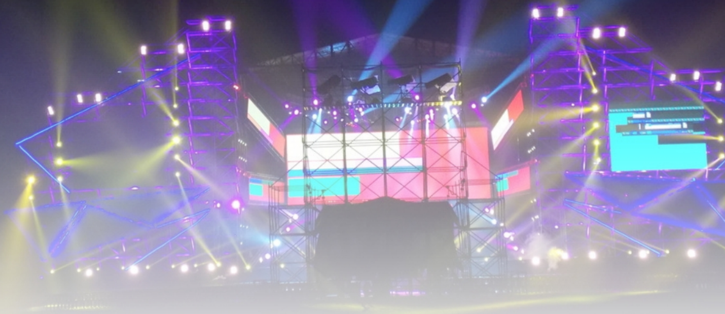
ZOOM 6x40w RGBW 4in1 led beam wash bar moving head light