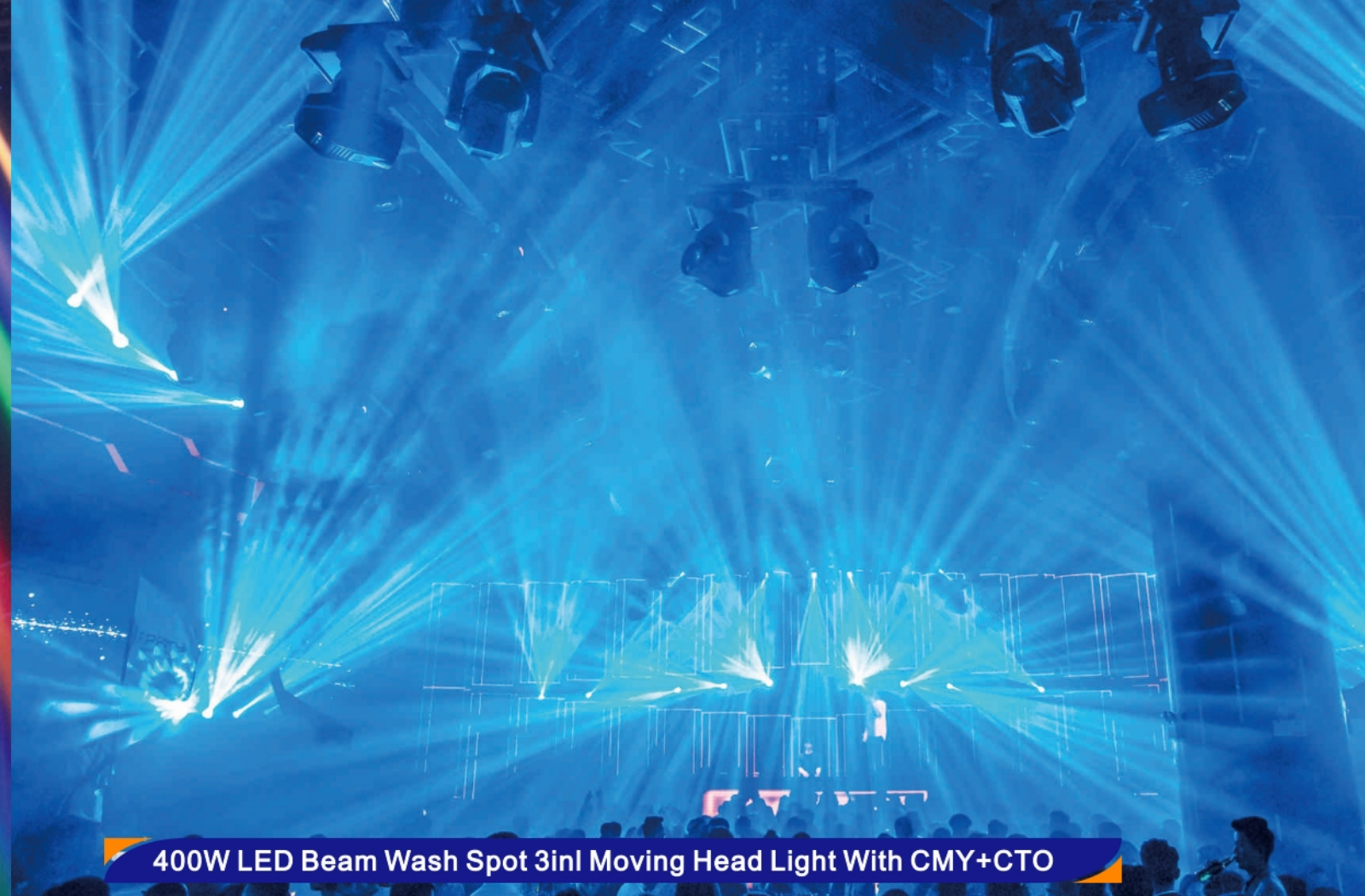
400W LED Beam Wash Spot 3in1 Moving Head Light With CMY+CTO