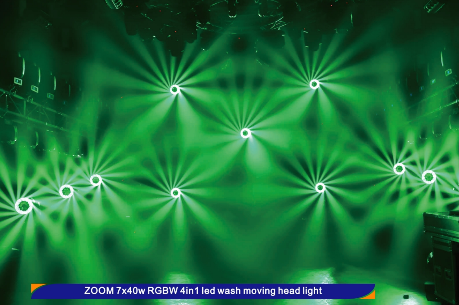
ZOOM 7x40w RGBW 4in1 led wash moving head light