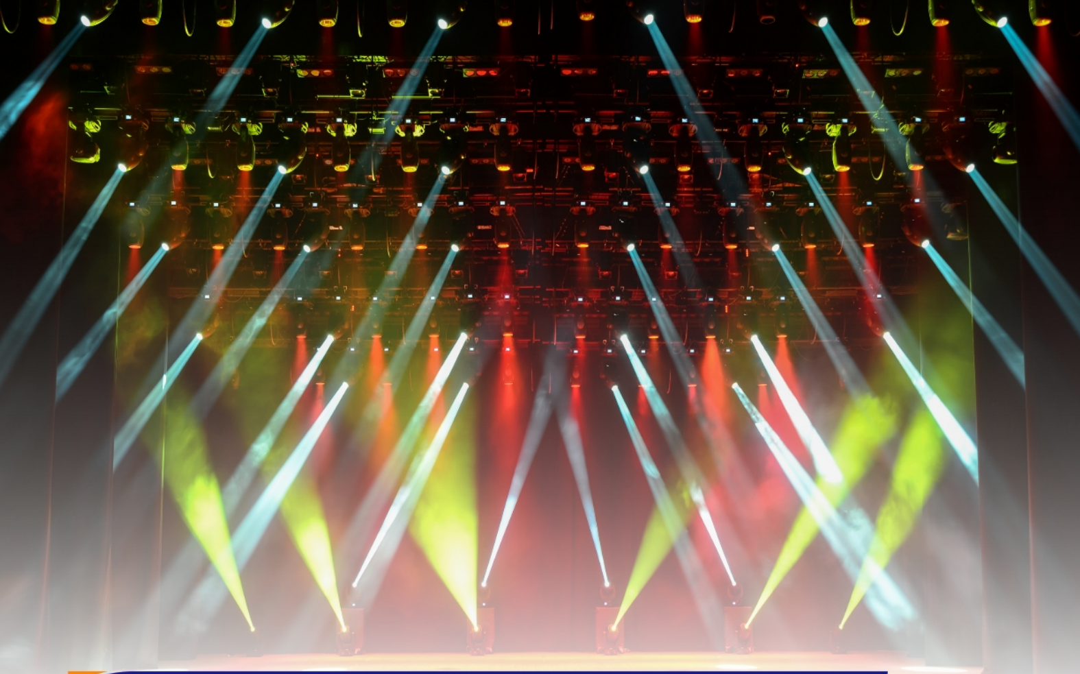
ZOOM 19x15w RGBW 4in1 led wash moving head light with circle control