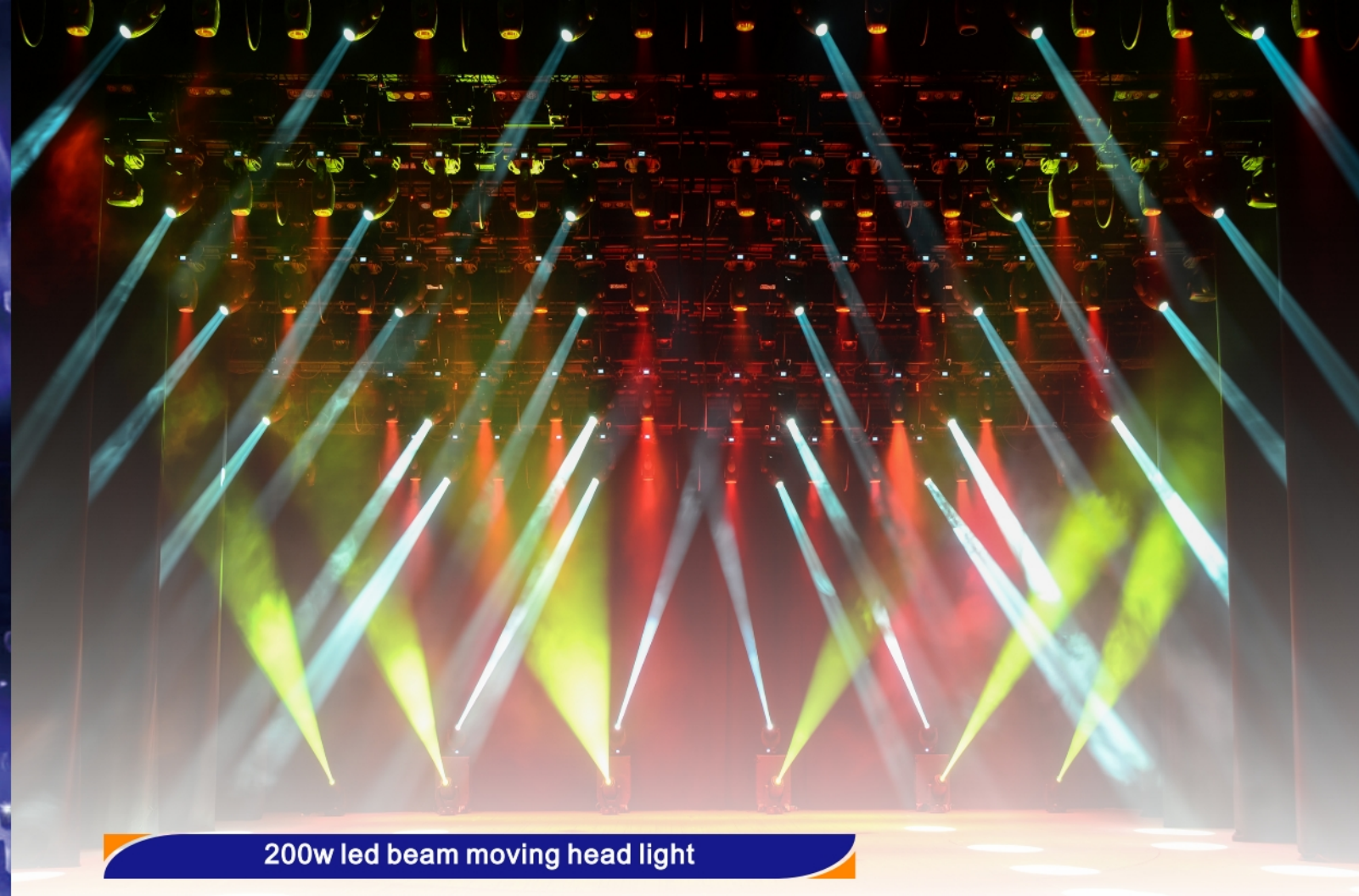
200w led beam moving head light