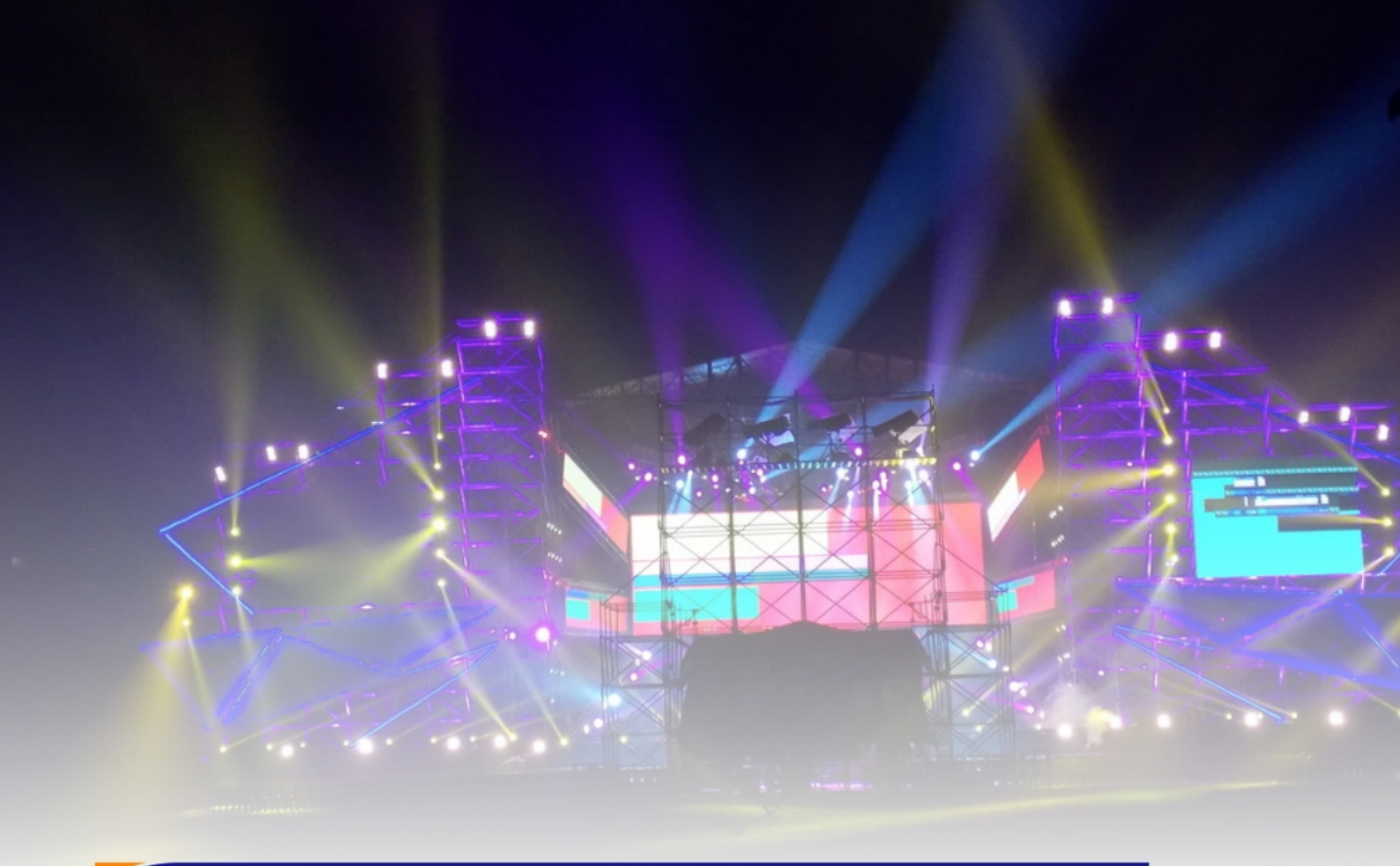
ZOOM 19x15w RGBW 4in1 led wash moving head light with backlight