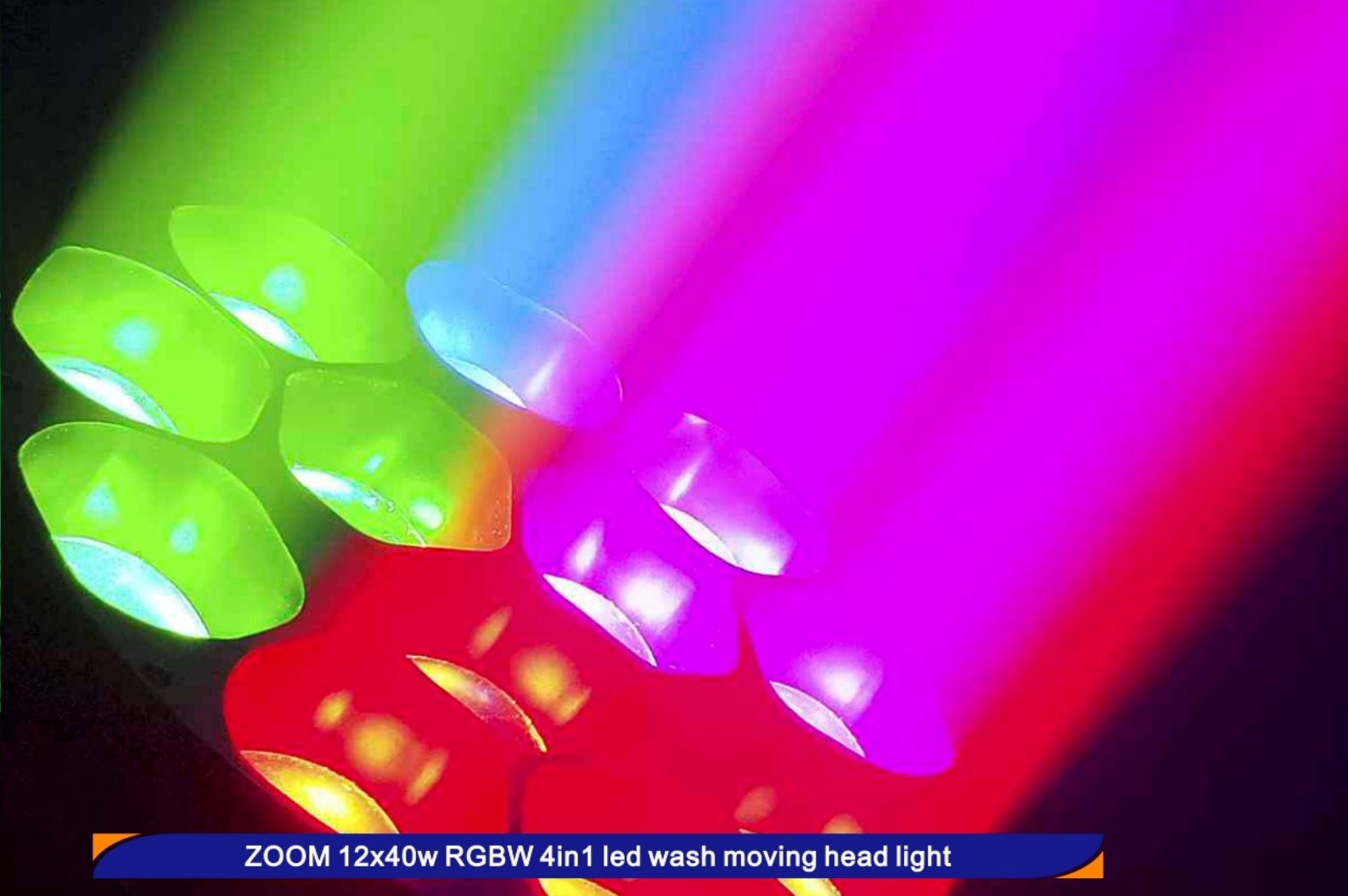
ZOOM 12x40w RGBW 4in1 led wash moving head light