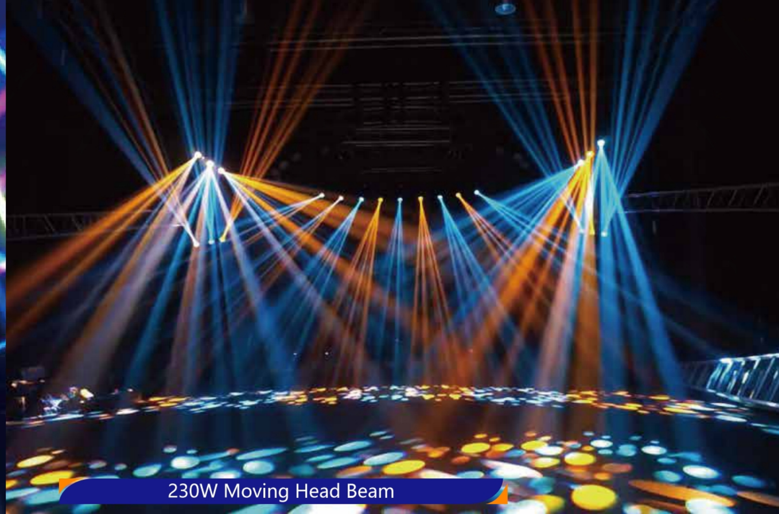
230W Moving Head Beam