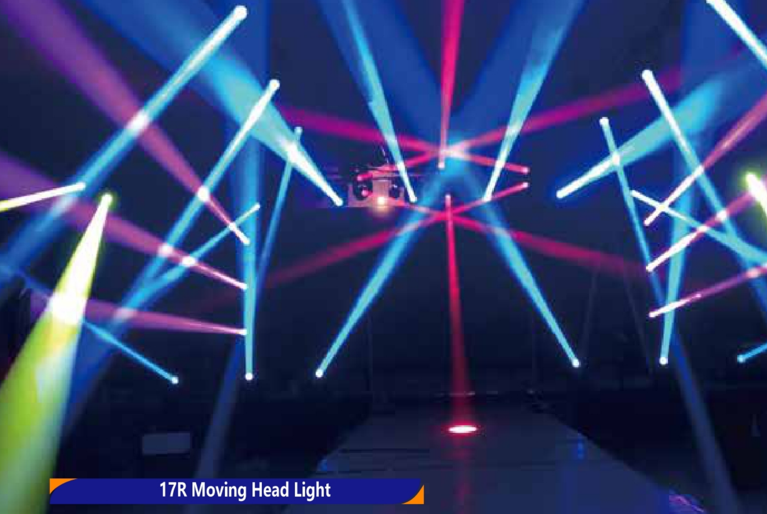
17R Moving Head Light