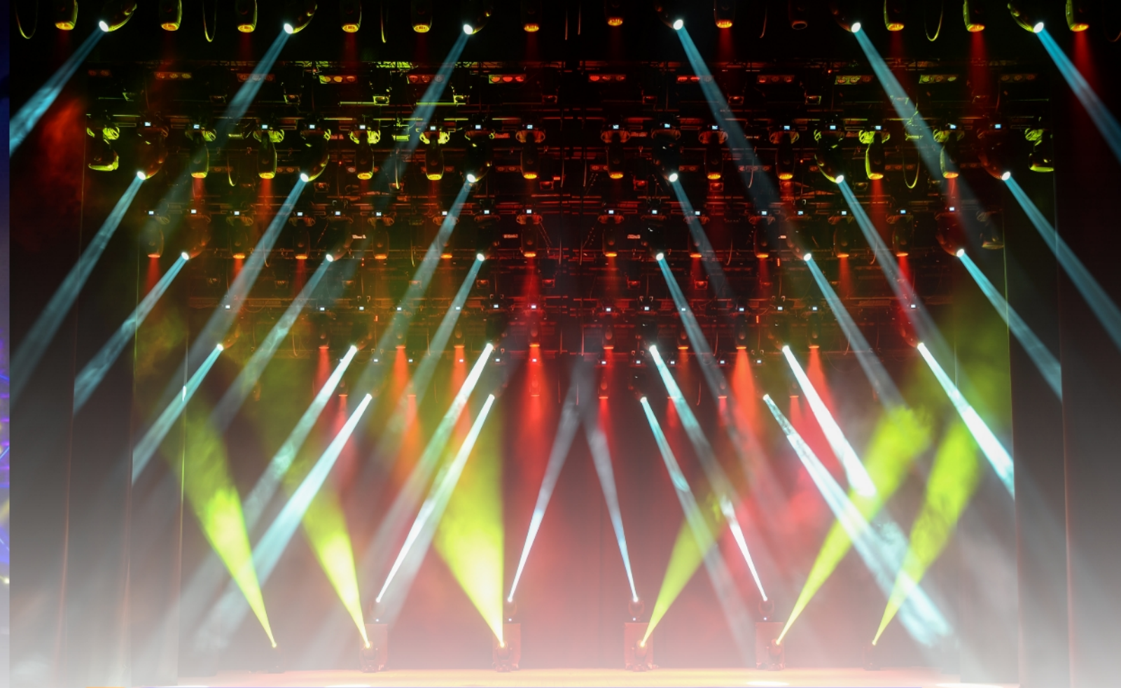
ZOOM 12x40w RGBW 4in1 led beam wash bar moving head light