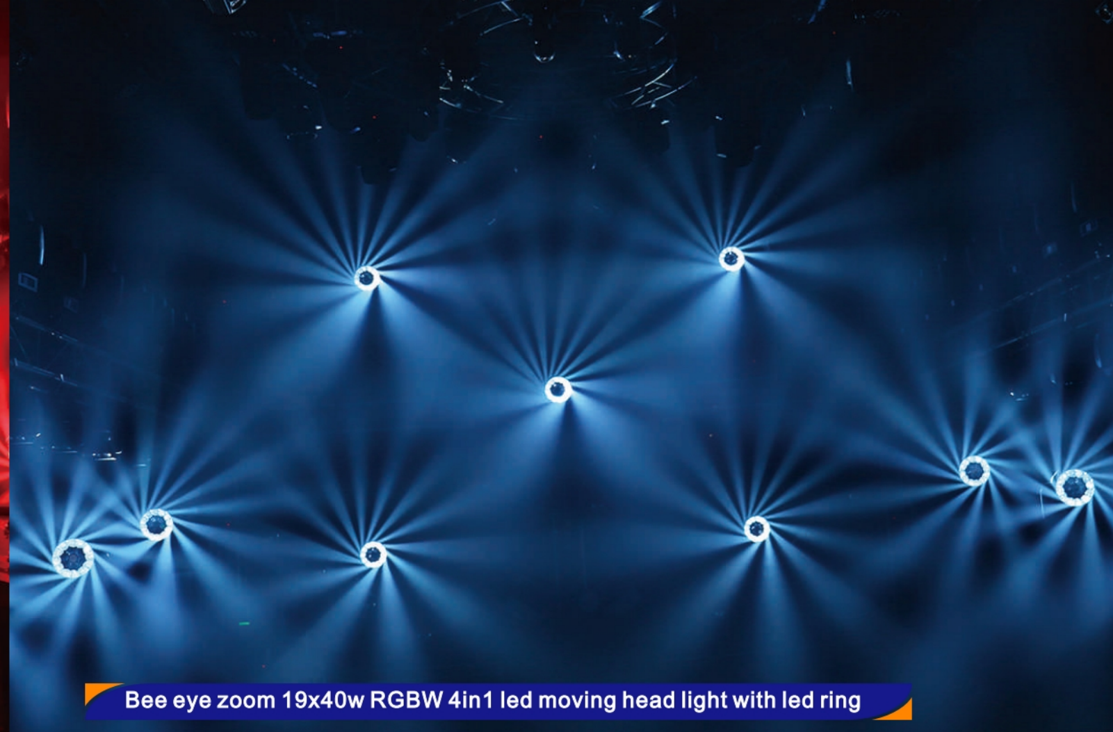
Bee eye zoom 19x40w RGBW 4in1 led moving head light with led ring