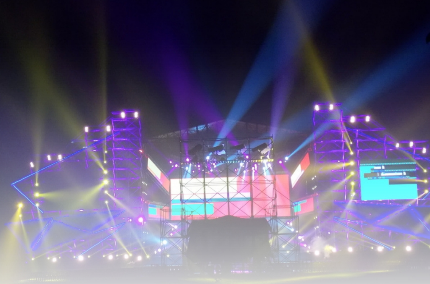
400W led beam wash spot 3in1 moving head light