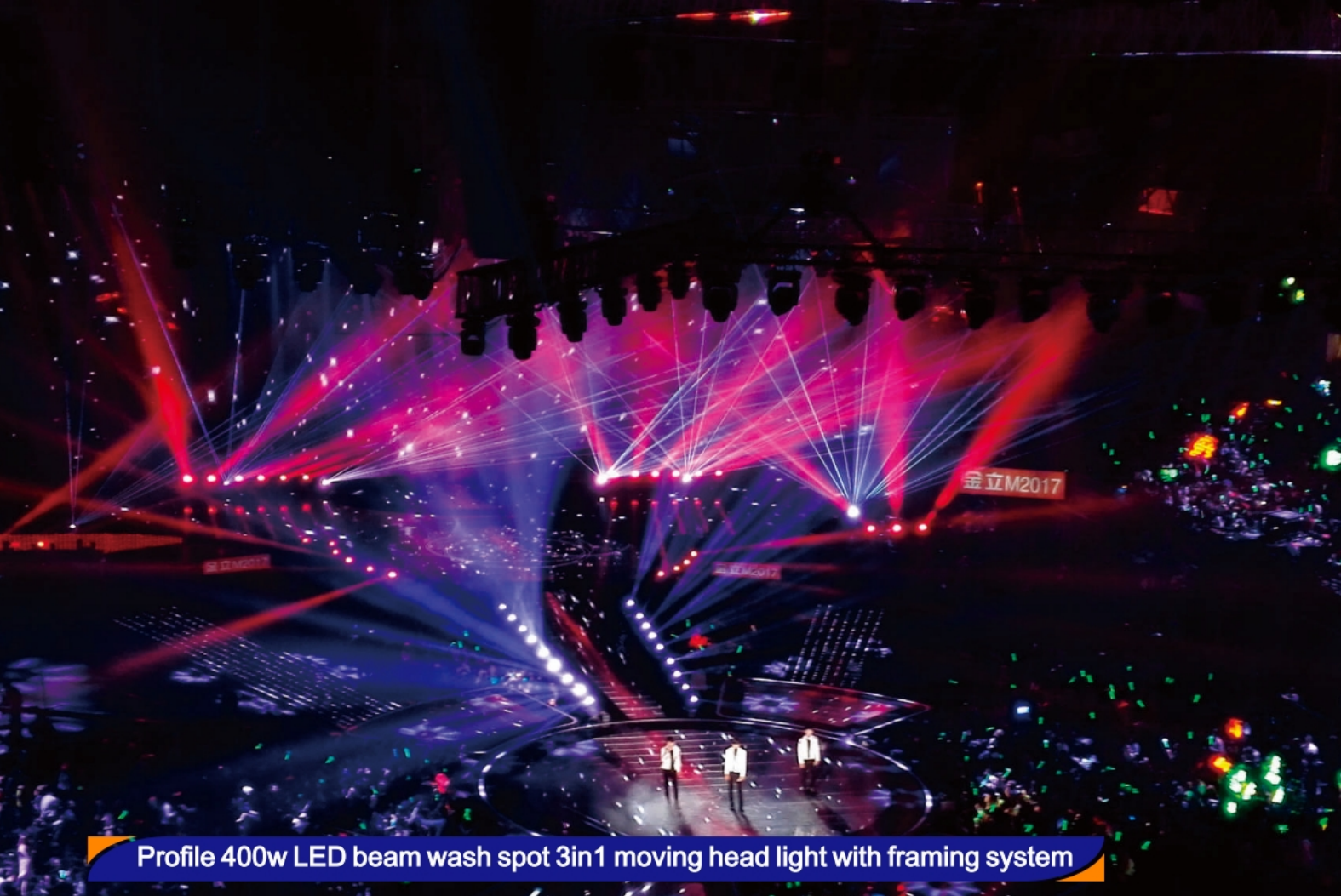
Profile 400w LED beam wash spot 3in1 moving head light with framing system